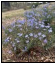
Linum lewisii , Blue Flax, Photo: Marie Kilty, Centennial CO

If you're growing thirsty plants, things could get dicey. But think of this as an opportunity to refresh the garden! Plants that require less water are perfect for the Colorado landscape. Drought tolerant plants are plants that can tolerate cold winters and hot summers and require little to no supplemental water once they're established. If you'd like to try growing perennials that can withstand whatever Colorado throws at them, here are a few plant suggestions from my list of favorites!