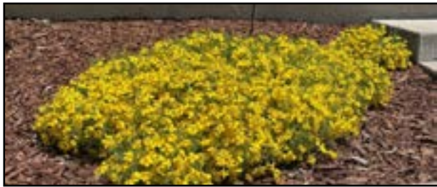
Zinnia grandiflora Prairie Zinnia, Photo: Marie Kilty, Centennial Colorado

The pale blue to dark blue delicate flowers of the Blue Flax plant are beloved by most gardeners. This native perennial is one of the first perennials to bloom in the spring and grows up to an elevation of 9500 ft. I can personally attest to this as it is one of the only surviving wildflowers, spread by seed, that I planted last year!