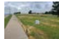
For drought considerations, don't water nonfunctional grass areas like those along roads and sidewalks.