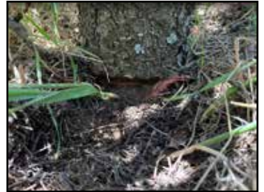
This pinyon pine is on the way out, thanks to this twine that was left on at planting.

excessive amounts of water, and decompose, reducing the total volume of soil in the planting hole. For rapid root establishment and eliminating post-planting stress, the focus needs to be on creating a planting hole with the correct width and depth.