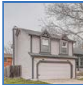
Tollgate Village SOLD IN JUST 3 DAYS FOR $415,000!