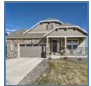
Whispering Pines SOLD IN JUST 15 DAYS FOR $712,500!

Who do you know who might be interested in buying or selling a home that you could refer to our real estate sales team?