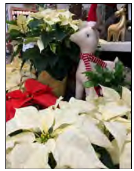
With care, these plants will be ready to deck the hall year after year.

You can artificially create these long night conditions by covering your plant with a large box or placing it in a dark closet. The next morning a remove the box or place the plant back in the light. Plants need at least 14 hours of complete darkness each night for a couple of months to initiate flowering. Once you start to see the bracts changing color, you can stop covering the plant each night and prepare to enjoy the show!