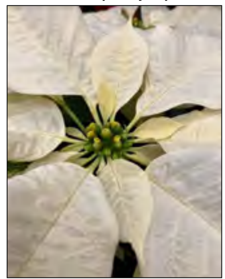
The true flowers of poinsettias are actually quite small—and green!