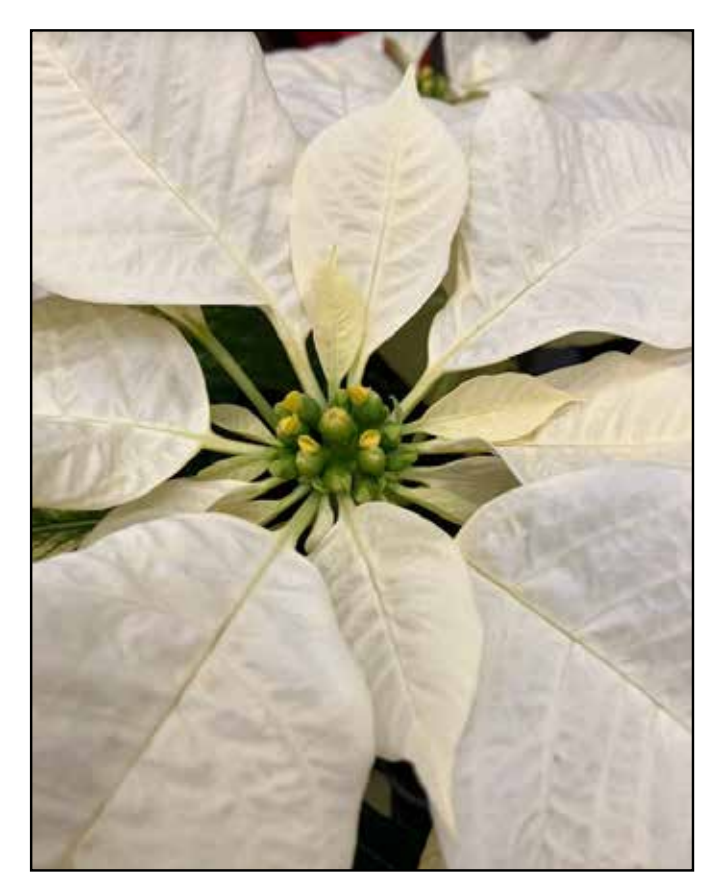
The true flowers of poinsettias are actually quite small—and green!