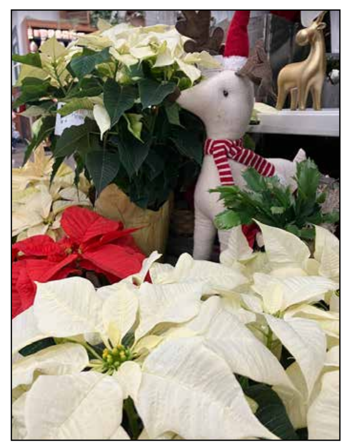
With care, these plants will be ready deck the hall year after year.

You can artificially create these long night conditions by covering your plant with a large box or placing it in a dark closet. The next morning a remove the box or place the plant back in the light. Plants need at least 14 hours of complete darkness each night for a couple of months to initiate flowering. Once you start to see the bracts changing color, you can stop covering the plant each night and prepare to enjoy the show!