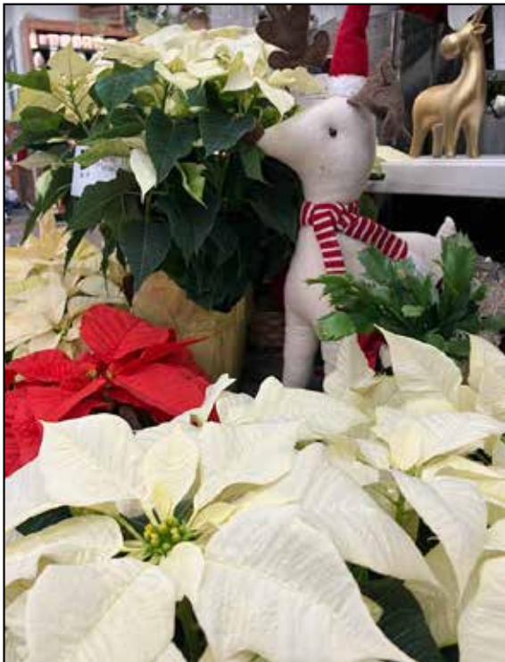
With care, these plants will be ready to deck the hall year after year.

You can artificially create these long night conditions by covering your plant with a large box or placing it in a dark closet. The next morning, move the box or place the plant back in the light. Plants need at least 14 hours of complete darkness each night for a couple of months to initiate flowering. Once you start to see the bracts changing color, you can stop covering the plant each night and prepare to enjoy the show!