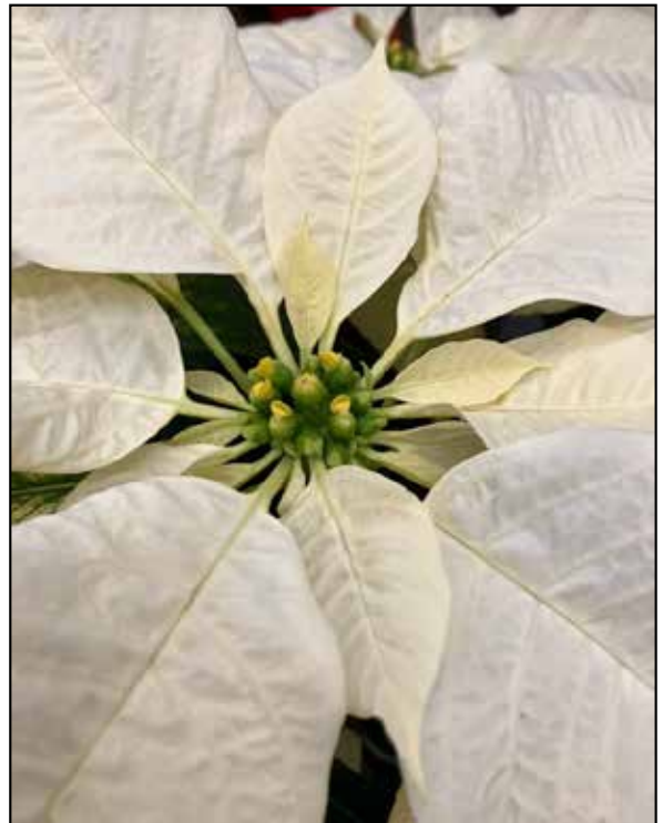
The true flowers of poinsettias are actually quite small—and green!