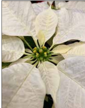
The true flowers of poinsettias are actually quite small—and green!