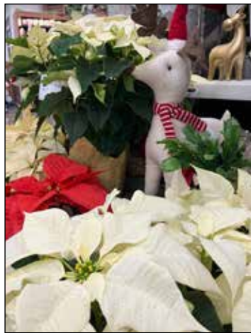
With care, these plants will be ready to deck the hall year after year.

The Association's Annual Membership and Budget Ratification Meetings are just around the corner. This year's meeting is scheduled on January 18, 2024 at 5:30 PM at the Overlook Clubhouse; 650 Orion Ave, Erie, CO 80516. With respect to the election this year, there is one (1) position on the Board of Directors up for election. The Board terms are three (3) years.