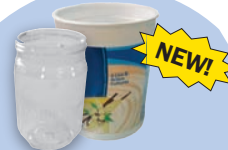
#1-7 Plastic tubs & screw-top jars (no lids, no #7 PLA compostables, do not flatten)