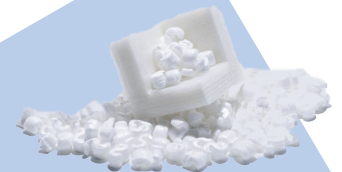
Polystyrene (#6) packing material (like computers and appliances come packed in). No peanuts, No LDPE (#4) Foam. It must be removed from the boxes.

Please follow these guidelines carefully: Please flatten all cardboard boxes. Empty and rinse all containers. Do not flatten containers.