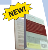
Paper- back books

NO Plastic Bags • Plastic Tops • Shredded Paper • Hard-Back Books • Scrap Metal • Tyvek® Envelopes • Plastic 6-Pack Holders • Needles or Syringes • Paper Ream Wrappers • Plastic Microwave Trays • Frozen Food Containers • Mirrors, Ceramics or Pyrex® • Light Bulbs, Plates or Vases • Drinking Glasses • Window Glass • Hazardous or Bio-Hazardous Waste • Plastics Other Than Those Listed • Tissues, Paper Towels, Napkins • Waxed Paper or Waxed Cardboard • Stickers or Sheets of Address Labels • Kraft® (orange/brown) envelopes • Styrofoam® Cups, Plates, Paper To-Go Food Containers