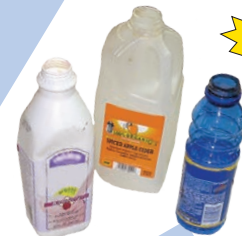
#1-7 Plastic Bottles

You can now place all recyclables in one bin!