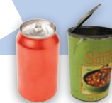
Cans (do not crush or flatten)