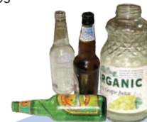
Glass bottles & jars

You can now place all recyclables in one bin!