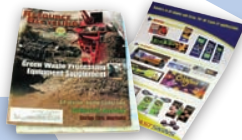
Magazines, brochures & catalogs