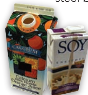
Paper milk/ juice cartons (no foil pouches, do not flatten)