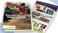
Magazines, brochures & catalogs