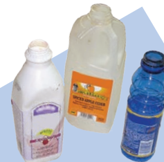
#1-7 Plastic Bottles