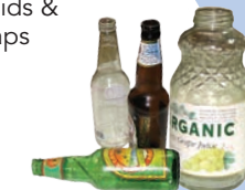
Glass bottles & jars