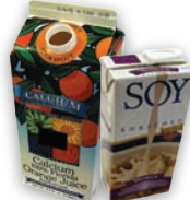
Paper milk/ juice cartons (no foil pouches, do not flatten)

NO Plastic Bags • Plastic Tops • Shredded Paper • Hard-Back Books • Scrap Metal • Tyvek® Envelopes • Plastic 6-Pack Holders • Needles or Syringes • Paper Ream Wrappers • Plastic Microwave Trays • Frozen Food Containers • Mirrors, Ceramics or Pyrex® • Light Bulbs, Plates or Vases • Drinking Glasses • Window Glass • Hazardous or Bio-Hazardous Waste • Plastics Other Than Those Listed • Tissues, Paper Towels, Napkins • Waxed Paper or Waxed Cardboard • Stickers or Sheets of Address Labels • Kraft® (orange/brown) envelopes Styrofoam® or Paper To-Go Containers