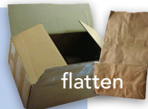
flatten Corrugated cardboard & paper bags

Please follow these guidelines carefully: Please flatten all cardboard boxes. Empty and rinse all containers. Do not flatten containers.