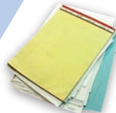
White or pastel office paper